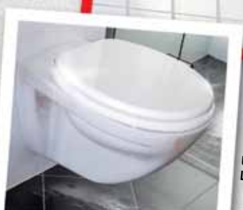
URINE SCALE AND LIMESCALE REMOVER