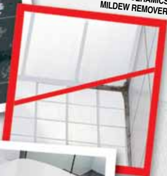
CERAMICS MILDEW REMOVER